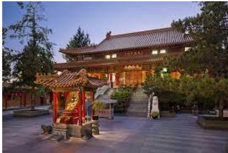
Figure 9 International Buddhist Centre

Today we return to Vancouver as it is the last day of the workshop. We will make our way back to Nanaimo to catch the ferry. After the ferry, we will head to the International Buddhist Temple, in Richmond. We will stay at Sandman Signature by the airport; the hotel offers airport shuttle. That evening we'll have our farewell dinner and say goodbye to all.