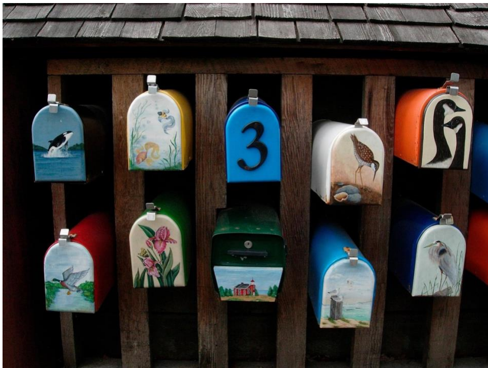
Figure 11 Mailboxes