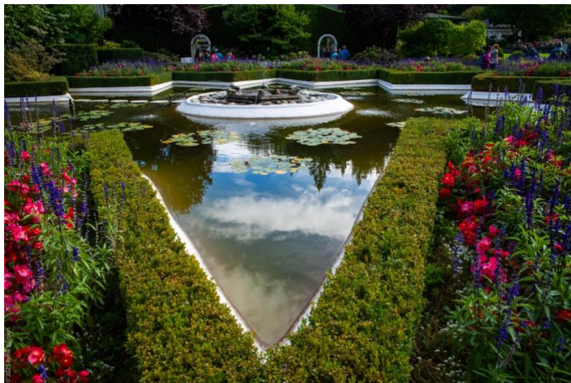
Figure 6 Butchart Gardens