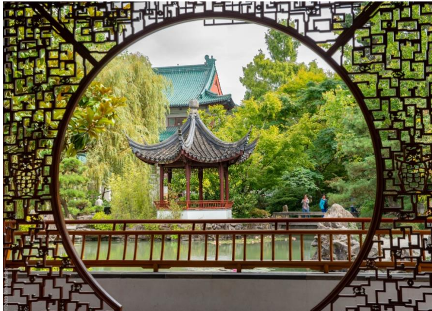
Figure 3 Sun Yat Set Gardens

This day begins in Vancouver as we discover some of its unique features. We'll walk into Gastown, part of the original settlement. After that we'll visit Sun Yat Sen Gardens, a spectacular traditional Chinese garden. Our next stop will be at the UBC Museum of Anthropology to shoot the exterior totem collection. We will finish the day on Granville Island, where we will find a public market, art exhibits, and an excellent brewery.