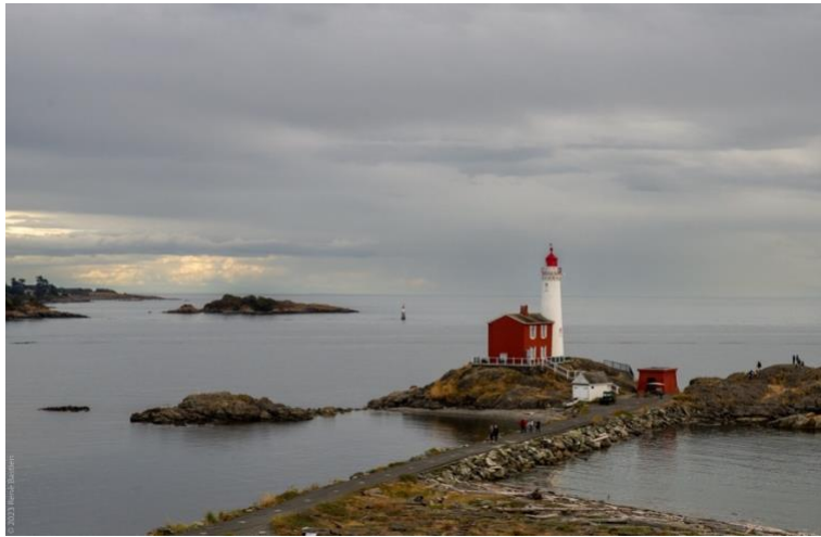
Figure 7 Fisgard Lighthouse

we will take the Victoria Harbour Ferry to Fisherman’s Wharf, to capture its colorful houses. We will then visit the Royal BC Museum for their impressive collection of First Nations totems, as well as a collection of paintings from Emily Carr, famous for her portrayals of the local indigenous peoples.