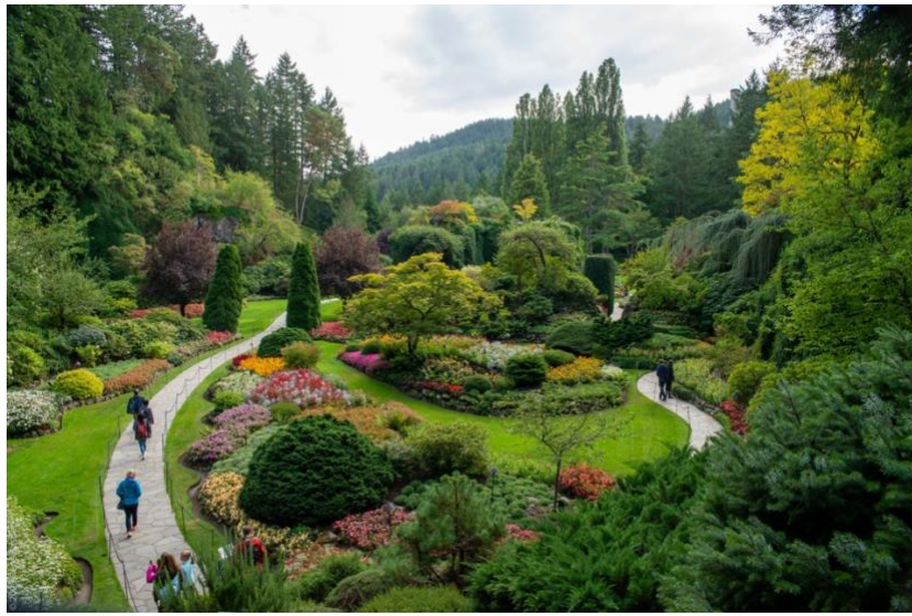
Figure 5 Butchart Gardens © René Bastien

Today we leave Vancouver and make our way to Victoria, the capital of British Columbia, which is located on Vancouver Island. We will take the ferry to get there and make our way to Butchart Gardens. The gardens are spectacular, set in a repurposed quarry. We will then check into our hotel in Victoria. After that we'll go for a night shoot downtown to capture the lights on the Parliament Building, and perhaps frame and expose to show car head and taillights passing by. We will stay at the Best Western Plus Inner Harbour.