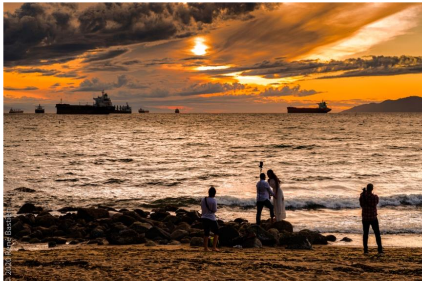
Figure 2 Sunset, English Bay