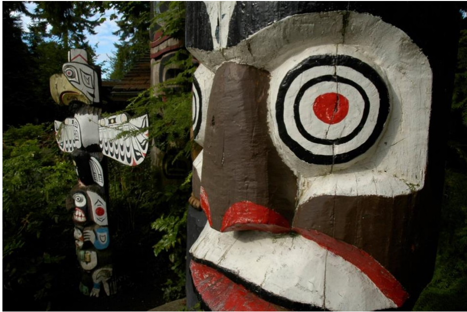
Figure 10 Totem details

To reserve seats, please send me an email at rbastien@highlightphototours.com and I will send you a PayPal invoice.