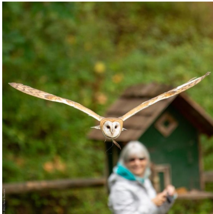
Figure 8 Barn Owl, Raptor Center

Today we make our way to the west coast of Vancouver Island, to the town of Ucluelet. We will first visit The Raptors falconry center to photograph the birds there. After that we’ll head to Nanaimo where we will embark on a coastal tour by plane. After lunch, we will head to Ucluelet where we will walk around the harbor. We will stay at the Black Rock Resort, by the sea. Sunsets are quite spectacular from the hotel grounds.