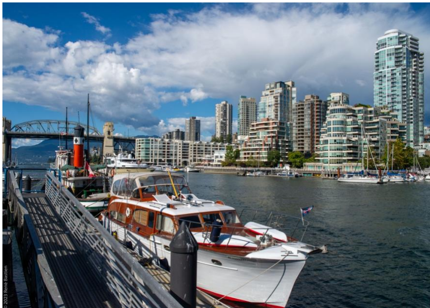
Figure 4 Granville Island marina © René Bastien