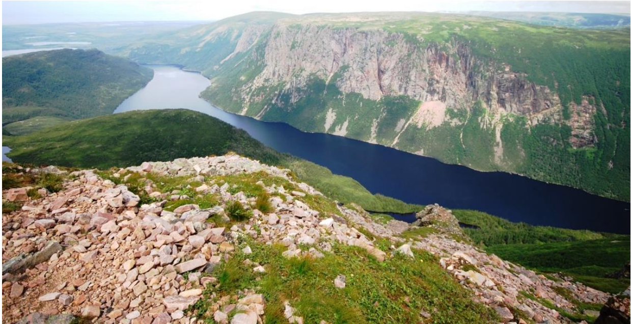
Gros Morne National Park.

Western Brook Pond boat tour. (Highlight for most visitors. 45 min hike in both directions with about 2 hours on the boat). Snack bar on site for lunch.